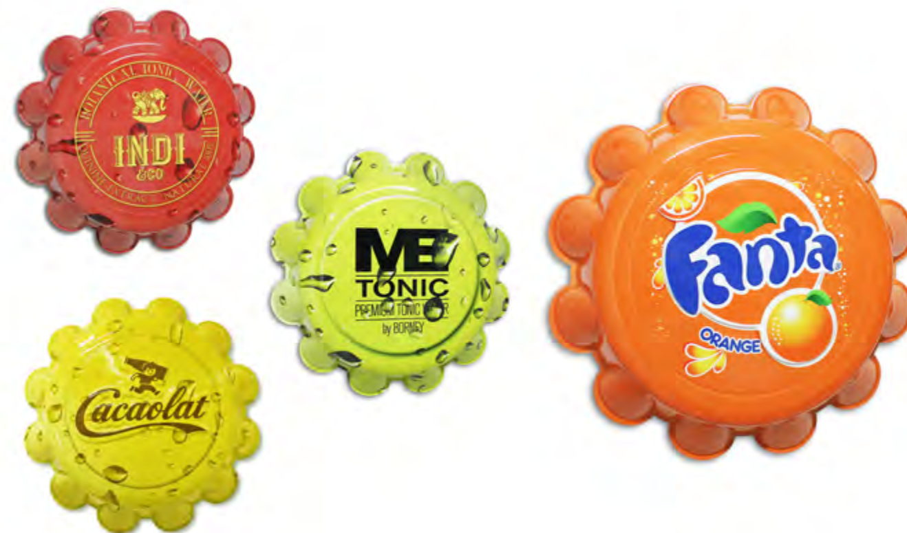
THERMOFORMED WALL SIGNAL DEVICES IN DIFFERENT SHAPES Great visual impact. Different products can be represented with different sizes.