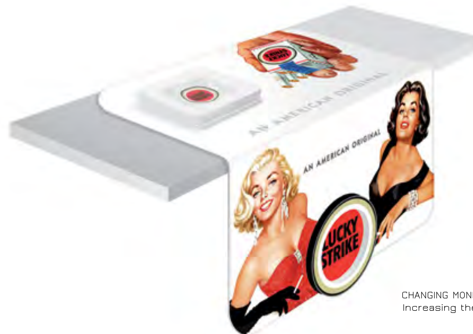
CHANGING MONEY THERMOFORMED TRAYS WITH ADVERTISING Increasing the visual impact when it covers a counter.