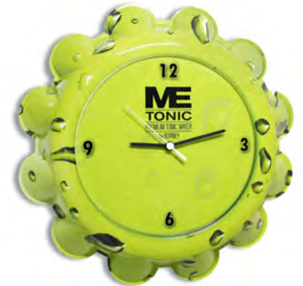
ADVERTISING THERMOFORMED WALL CLOCK Designs adapted to the brand, with quartz machinery, battery and hanger. Several clockwise designs.