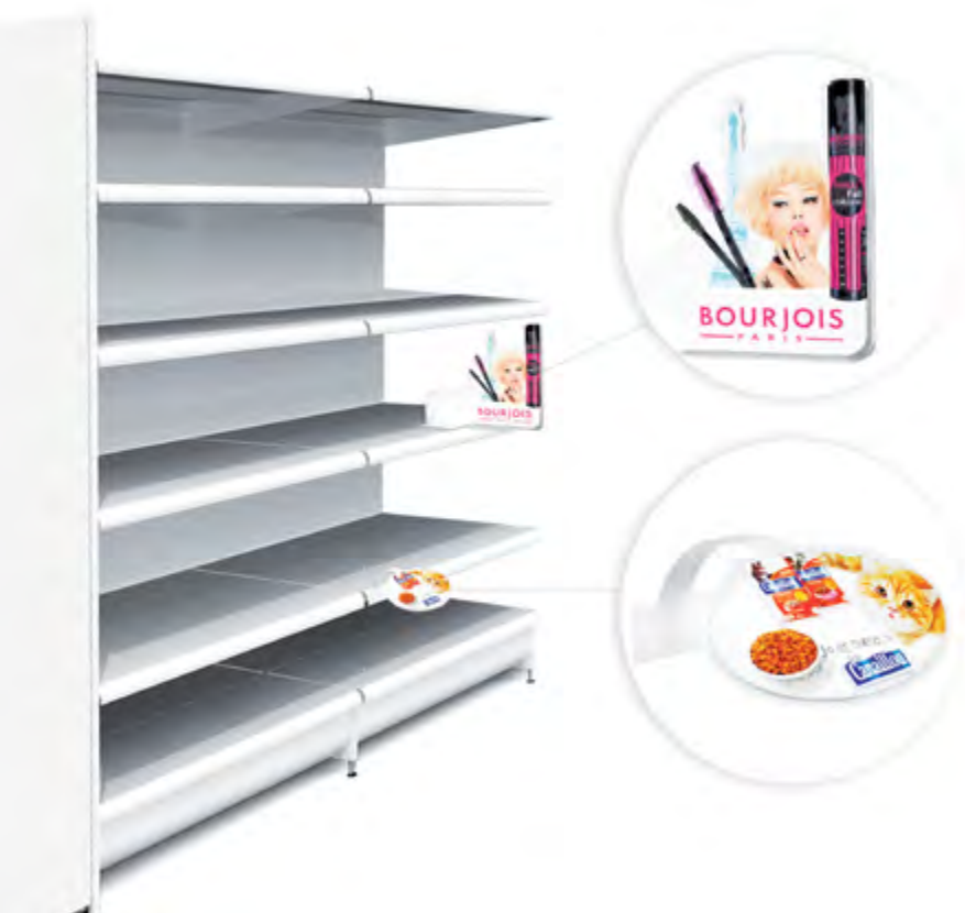
THERMOFORMED STOPPERS FOR SHELF APPEAL Adapted to the brand or product, printed on one or both sides. Different engagement systems are available, always providing a greater visibility.