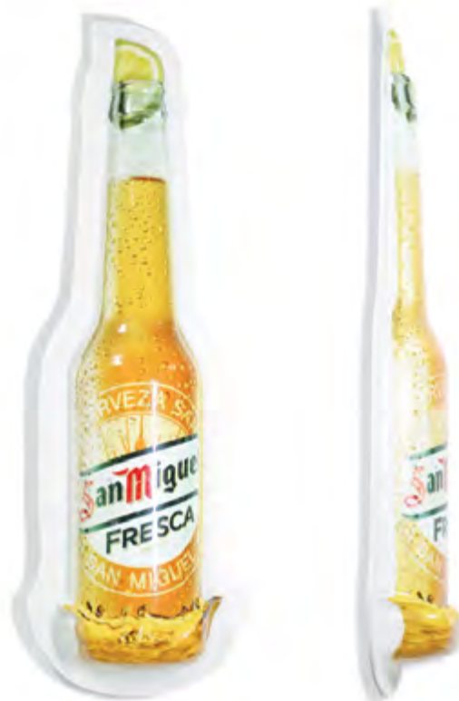
THERMOFORMED STOPPERS TO THE SHAPE OF THE PRODUCT. Realistic representation of products from different sectors: beverages, food, cosmetics, perfumes, toys ...