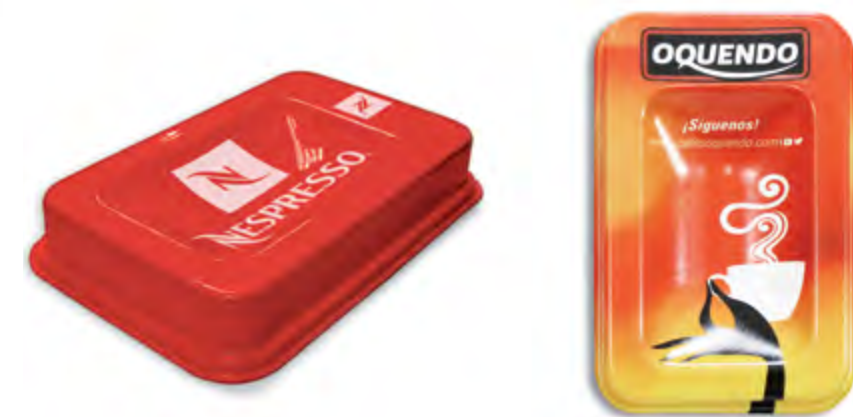
MONEY CHANGING THERMOFORMED TRAYS Custom printing adapted to the brand image. Check out others formatting possibilities.