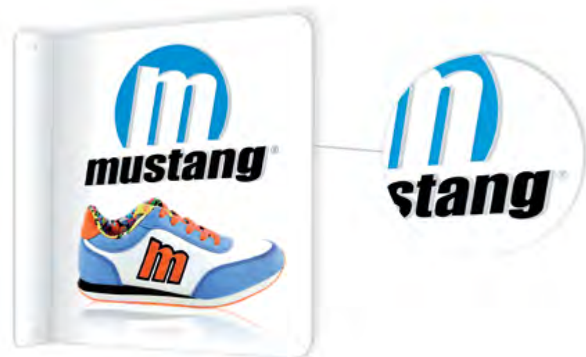
THERMOFORMED SIGNAL DEVICES, FLAG STYLE BANNER Made on both sides. For indoor and outdoor use. 100% customizable.