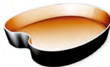
THERMOFORMED TRAYS. With curved lines design, different shapes, sizes and capacities.