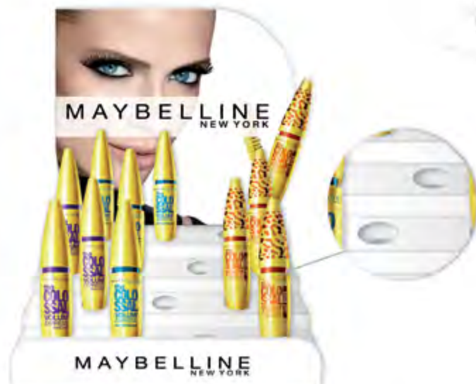
DISPENSER DISPLAYS For barcounter, table, counter or any other location within the facility. Thermoformed made combined with different materials (methacrylate, PET format, DM ...).