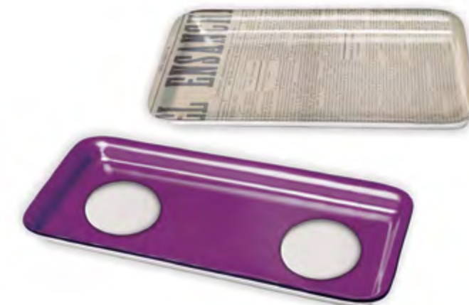
THERMOFORMED TRAY IN SMALL FORMAT Ideal for self-service and promotional gifts.