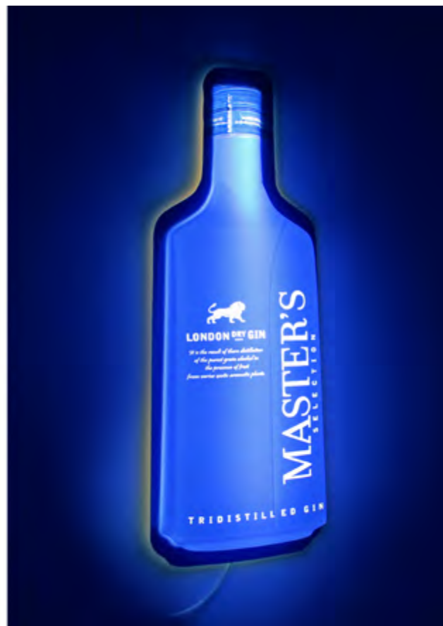
ADVERTISING THERMOFORMED BACKLIGHT. We can produce it in different shapes, finishes, sizes, prints and volumes (3D effect).