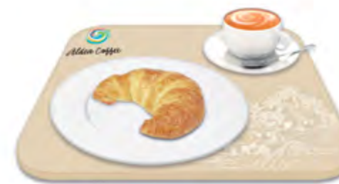
THERMOFORMED SELF-SERVICE TRAYS Adaptable on customer needs. 100% customizable printing.