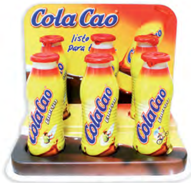
ADVERTISING COUNTERTOP DISPLAYS For barcounter, table, desk or any other location within the facility. Thermoformed made combined with different materials (methacrylate, PET format, DM ...).